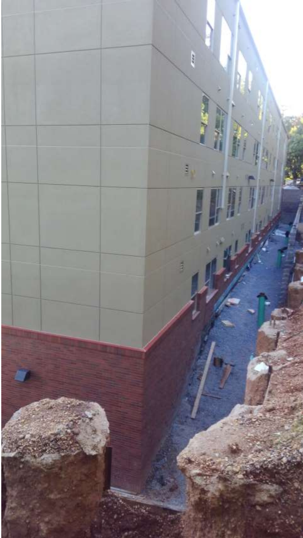
Showing measuring height of building at the lowest level of the wall at the base of the wall (Z.C. 13-06).