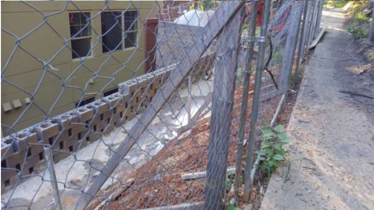
Photos of the structural two-tier retaining wall showing re-bar and poured concrete (impervious) in between the tiers. Retaining wall will be built up to alley level. Alley must be restored to abut the retaining wall.