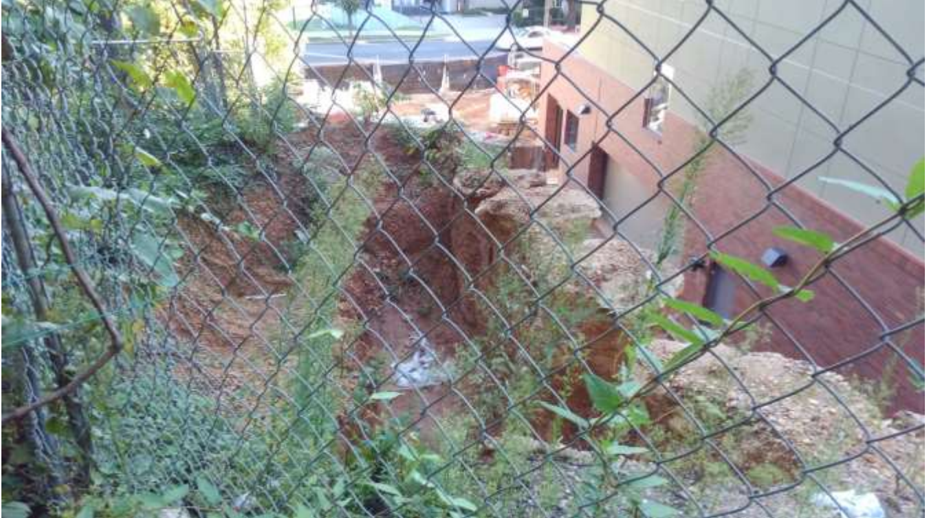
Side fence is positioned at approximate far side of public alley space. Lot/property line is approximately 2-3 feet to the right of rear portion of retaining wall. Not as-built in approved plan. Not sure what this pocket was carved in for, generator perhaps?